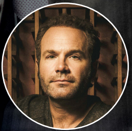
JOHN ONDRASIK Singer/Songwriter known as Five for Fighting